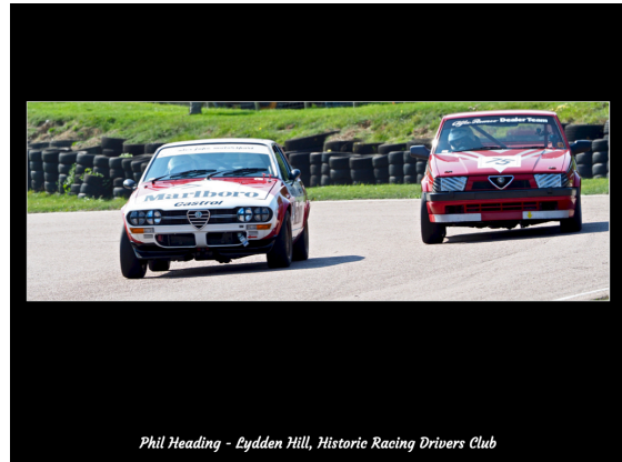
Phil Heading - Lydden Hill, Historic Racing Drivers Club