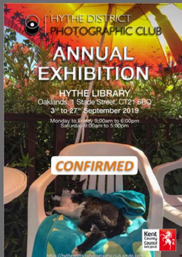
Photo-shoot proposals 2019

Food, Castles/Monuments, Lines/Shapes & Circles, Patterns in Nature, Spring Flowers, Name that Tune [Beatles song book], Humorous, [What makes you smile], Faces, Town of Hythe [guided tour], Nature on the Beach...